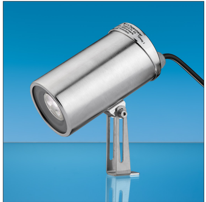
Lumistar luminaire USL 15-LED with hinged bracket