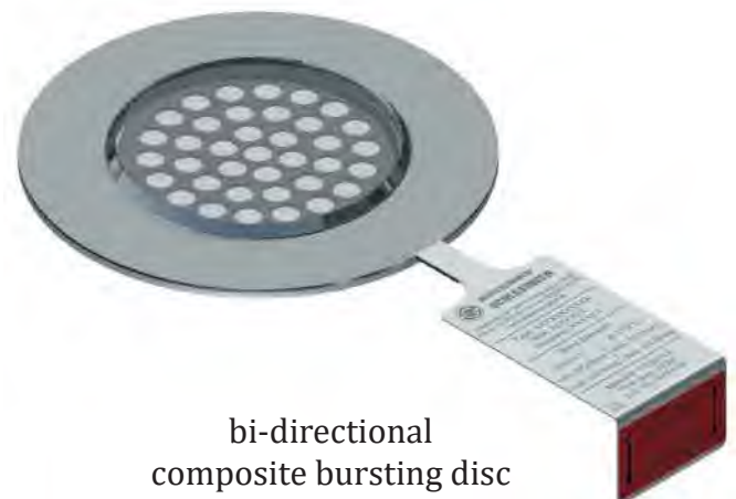
bi-directional composite bursting disc