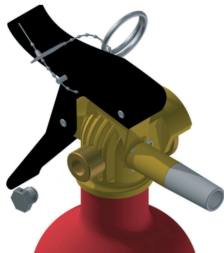
Installation: small bursting plug in fire extinguisher