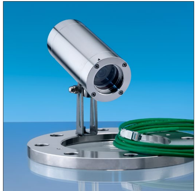
VISULEX camera K55-HD-Ex mounted on a flange with a hinged bracket

Network cable cat. 7 Flex, max. 60 m, 4x2xAWG 26, part no. L#3461.002.00