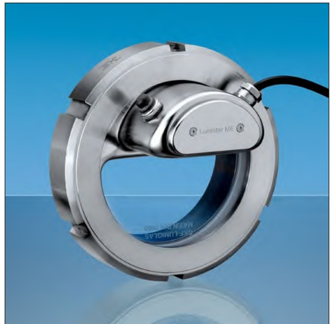
Lumistar luminaire ME-LED, installed in a screwed sight glass unit similar to DIN 11 851