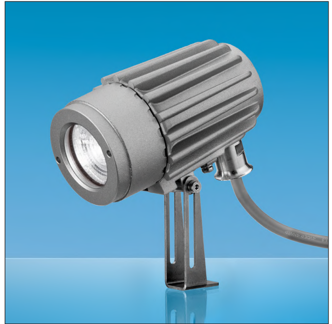
Lumistar luminaire USL 05LED-Ex

Works-fitted encapsulated pressure-tight power lead with screwed cable gland, optionally 2 m (standard), 5 m, 10 m, 20 m or externally tested and approved cable entry gland M20x1.5.