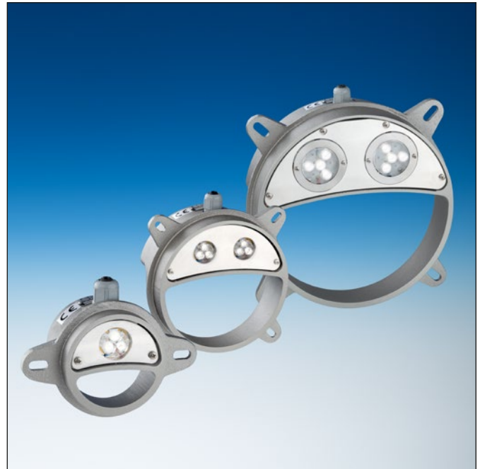
Lumiglas luminaires Lumistar-LED