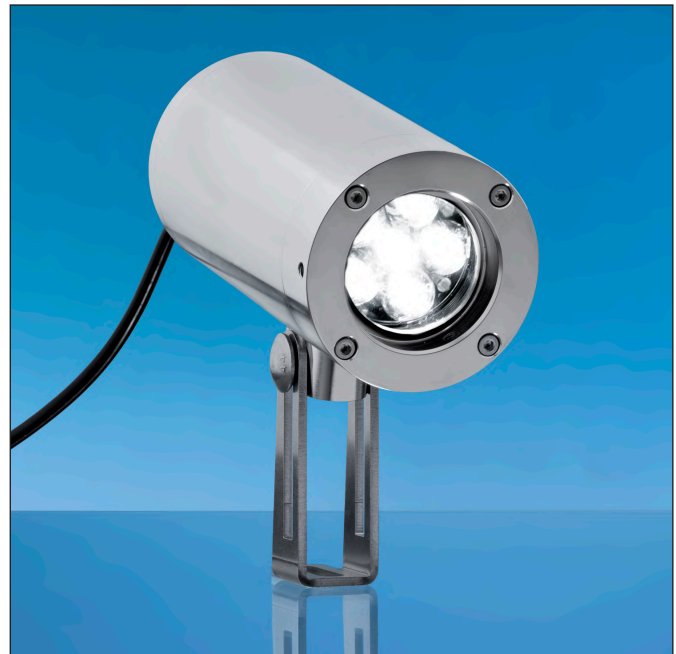
Lumistar luminaire ESL55LED-Ex