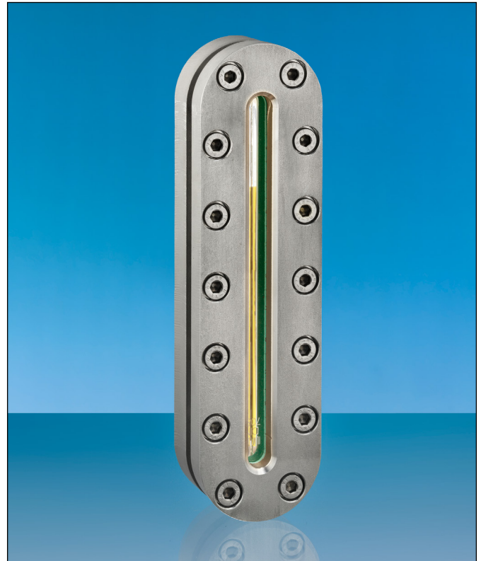
Complete assembly of a Lumiglas oblong oval sight glass fitting

When securing the cover flange, the bolts should be tightened with a uniform torque, starting with the bolts in the middle and working crosswise towards the ends, i.e. in an alternating sequence.