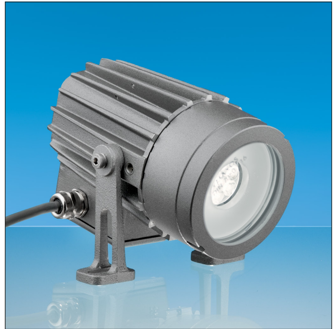
Lumistar luminaire USL 07-LED with terminal box