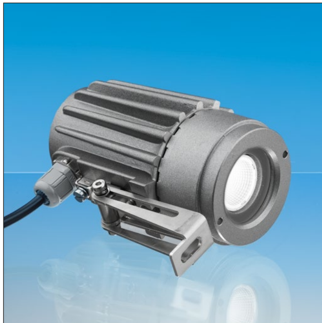
Lumistar luminaire USL 05-LED