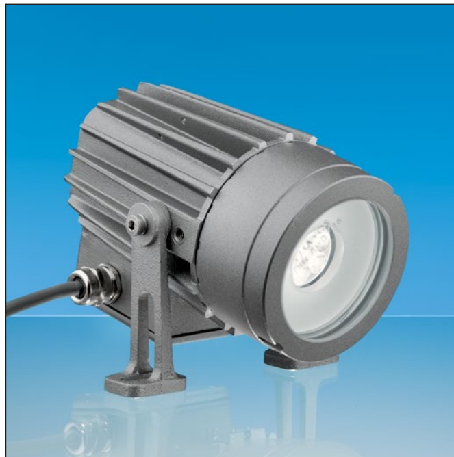
Lumistar luminaire USL 07 LED-Ex with terminal box