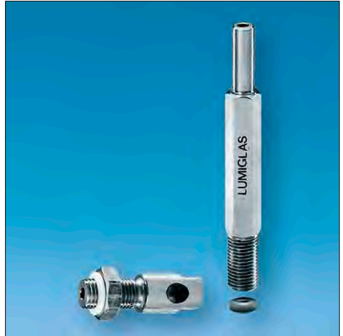
Lumiglas spray device