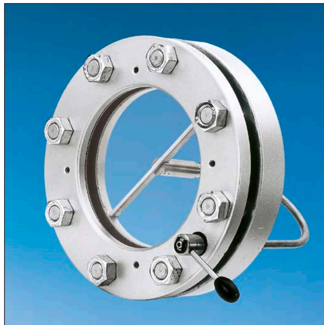
Lumiglas SW II BW mounted into sight glass fitting DIN 28120

Wiper blade: PTFE or silicone rubber All product contact parts are of stainless steel. Mechanical drive internal seal: PTFE