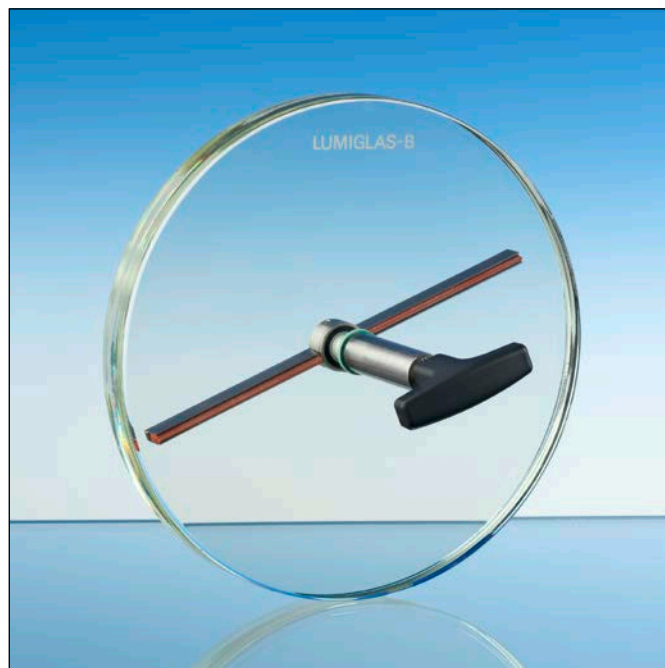
Lumiglas sight glass wiper SW I built into a sight glass disc

If the wiper is ordered separately, i. e. not installed into sight glass disc by the manufacturer, the assembly has to be done with regard to separate installation and operating instructions, attached to the delivery.