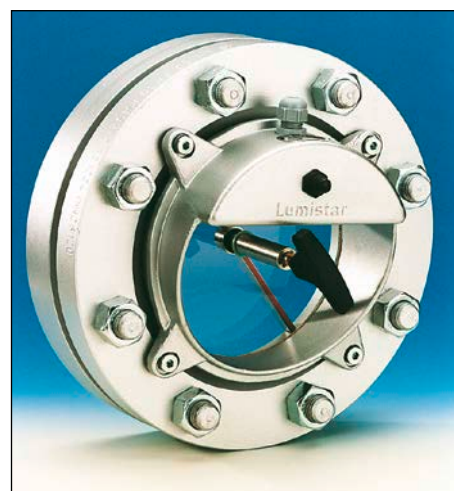
Lumiglas wiper SW I, as shown adjoining but with Lumistar luminaire fitted