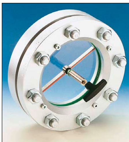
Lumiglas wiper SW I, fitted into sight glass assembly DIN 28120