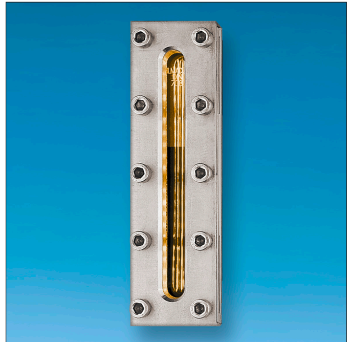
Complete assembly of a Lumiglas sight glass fitting rectangular

Progressively and carefully tighten down cover flange commencing with bolts in middle of flange and working outwards in crosswise alternating sequence (refer to sequence numbers 1-14 in illustration).