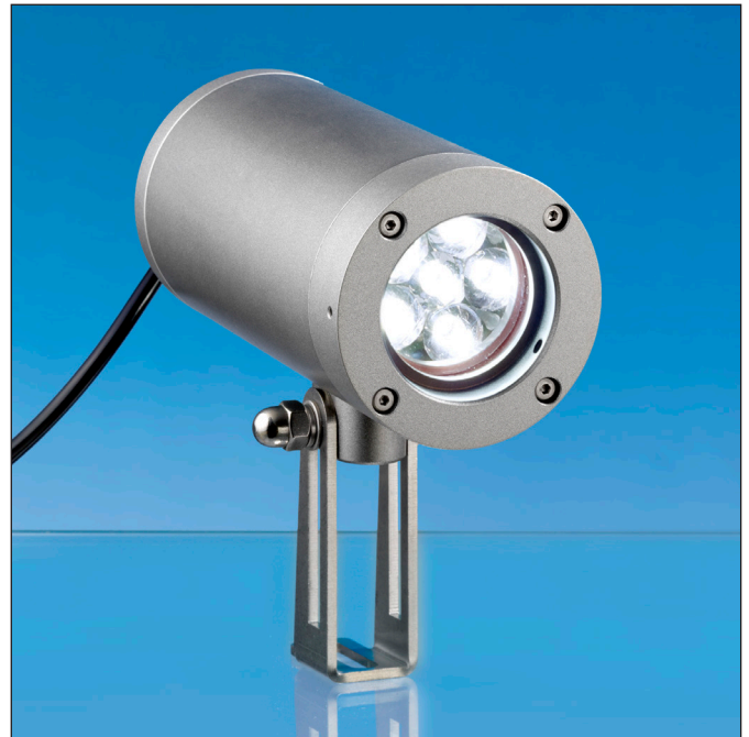
Lumistar luminaire ASL55LED-Ex