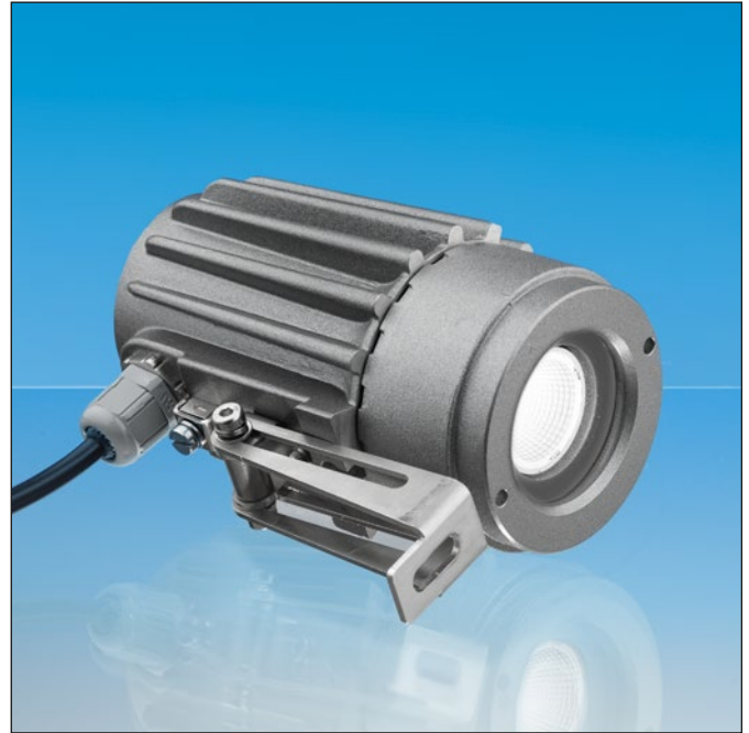
Lumistar luminaire USL 05-LED