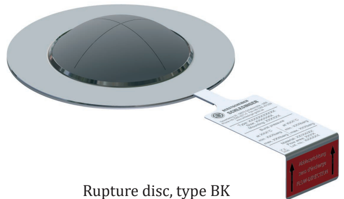
Rupture disc, type BK

*Inconel and Hastelloy are registered trade names