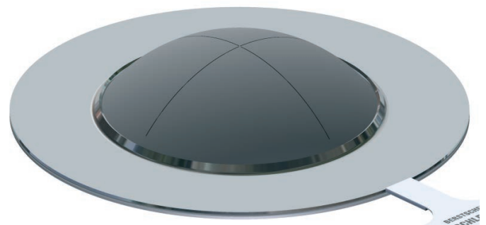
Detail rupture disc, type BK