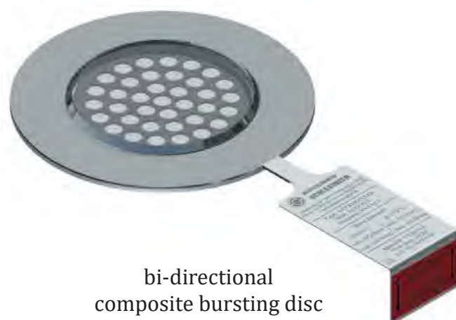
bi-directional composite bursting disc

Since they open fragment free, they can easily be installed in front of a safety valve. In addition, we can provide our composite bursting discs with burst detection.