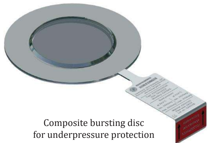
Composite bursting disc for underpressure protection

*Inconel and Hastelloy are registered trademarks©