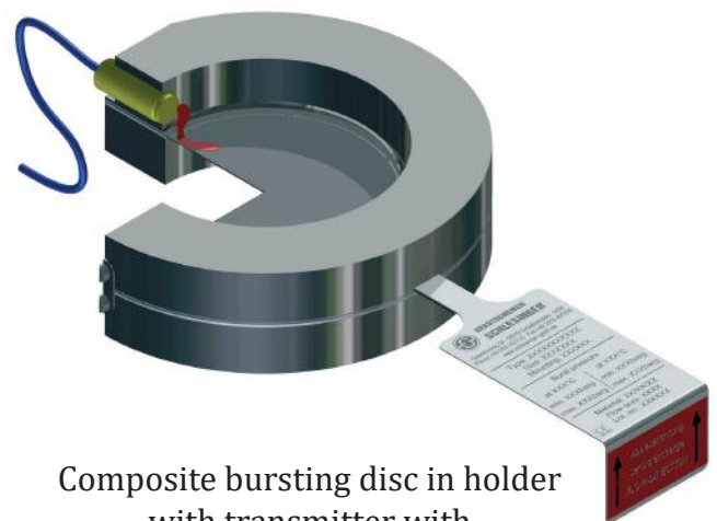
Composite bursting disc in holder with transmitter with inductive proximity switch