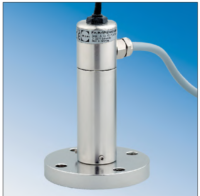
Mini Lumistar luminaire USL 31 for BioControl applications