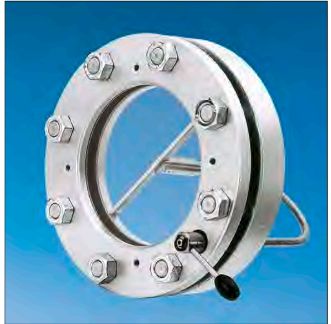
Lumiglas SW II BW mounted into sight glass fitting DIN 28120

Wiper blade: PTFE or silicone rubber All product contact parts are of stainless steel. Mechanical drive internal seal: PTFE