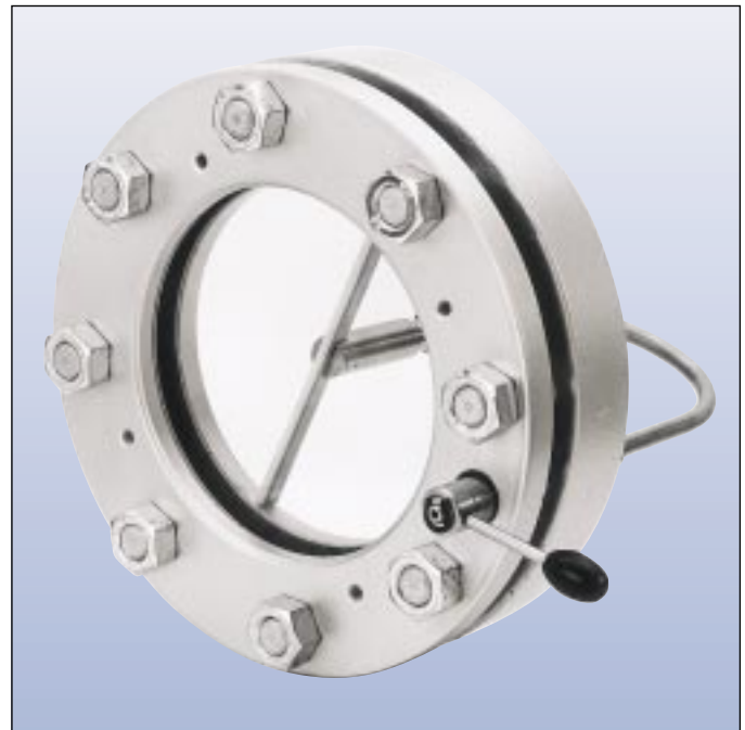
Sightglass Wiper type SW II BW mounted into sightglass fitting DIN 28120.

Should you order a complete sightglass assembly with the wiper type SW II, the additional machining of the base will be carried out by Papenmeier.